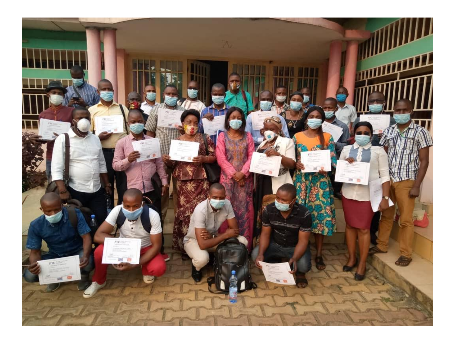
Figure 1: Participants and instructors with certificates outside the training centre in Kimpese